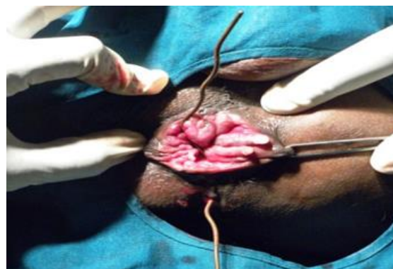
Fig 1 Arsho-Bhagandara after probing

shaped incision was made on the skin adjacent to primary pile, so that the base of this 'V' was directed towards the primary pile and the apex away from the centre of the anus.