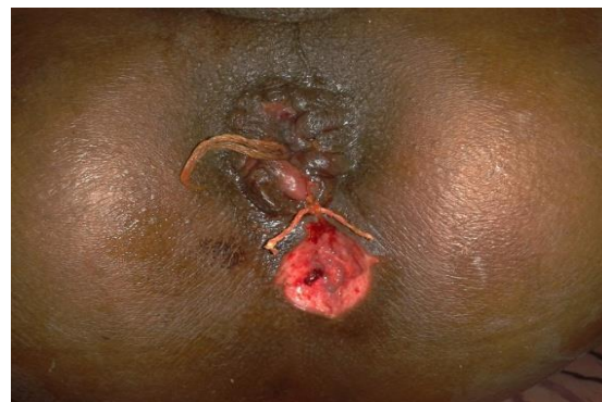
Fig 3 During follow up

Follow up of patients were done daily for 1 week to assess the post-operative recovery after that the patient was discharged (Figure 3).