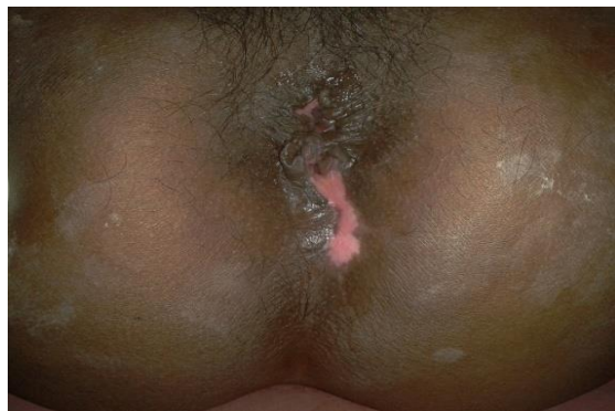
Fig 4 After complete healing

achieved after 2 weeks of Kshara Sutra cut through ( Figure 4 ). There was no recurrence noted even after 10 months of follow up.