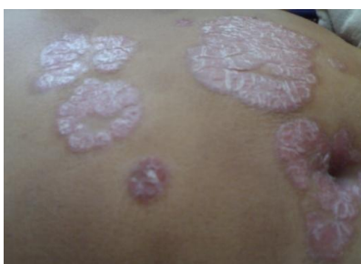
Figure 4 Before treatment