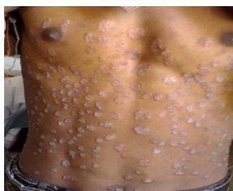
Figure 2 Before treatment