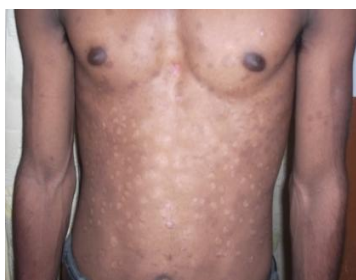
Figure 3 After treatment